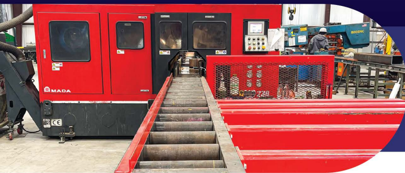
Image: Amada Saw - One of the few high speed cold saws that can cut up to nine inch OD.

With over 100+ years combined experience in the steel industry, JP Steel understands the importance of quality products and exceptional service; the founding principles of our company.