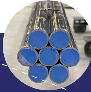
Seamless Carbon & Alloy Mechanical Tubing