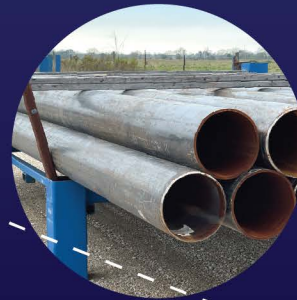
Welded & Seamless Pipe: A53, A106, X Grade, A333 & More