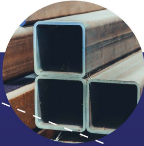
Square & Rectangular Structural Tubing

We take great pride and effort in partnering with our clients to meet their particular needs - turnkey or custom - to complete the job on time, every time.