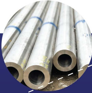
Stainless Steel Bar, Pipe & Tube

(Charpy Tested To Meet DNV Offshore Rig Requirements)